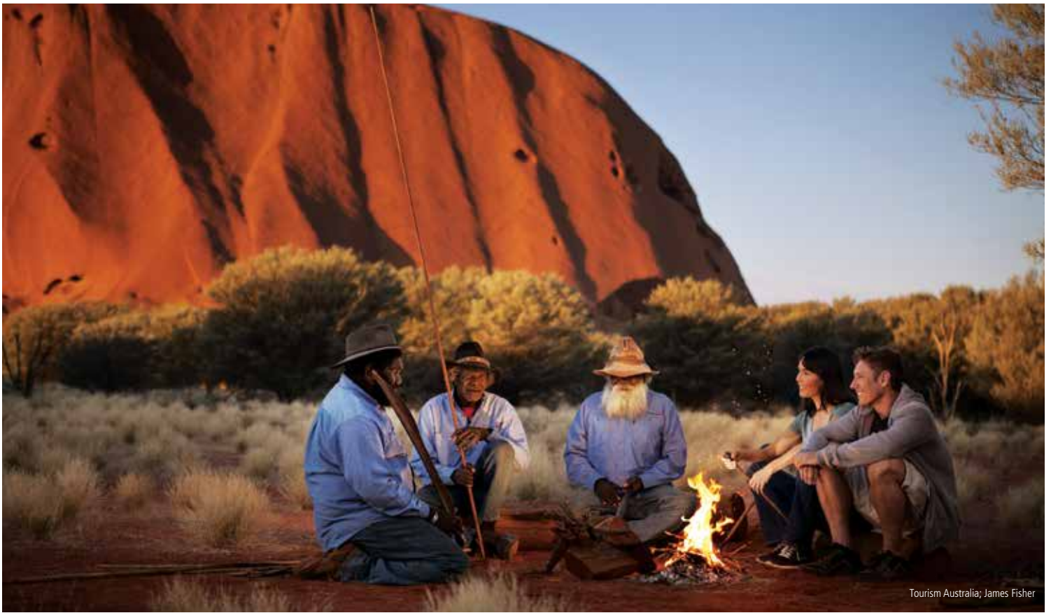
Tourism Australia; James Fisher