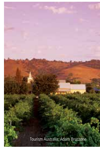
Tourism Australia; Adam Bruzzone