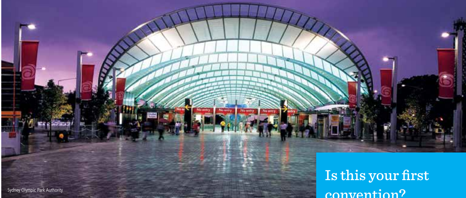
Sydney Olympic Park Authority

Stay up-to-date on convention news with the free RI Convention Update e-newsletter. Sign up at www.rotary.org/newsletters .