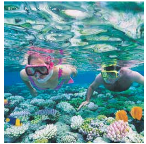
The Great Barrier Reef — Cairns