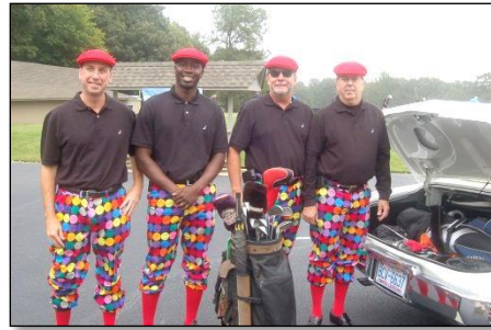
2013 Most Conspicuous (again) – the retreads from Troy. They arrived in a bad charriot: