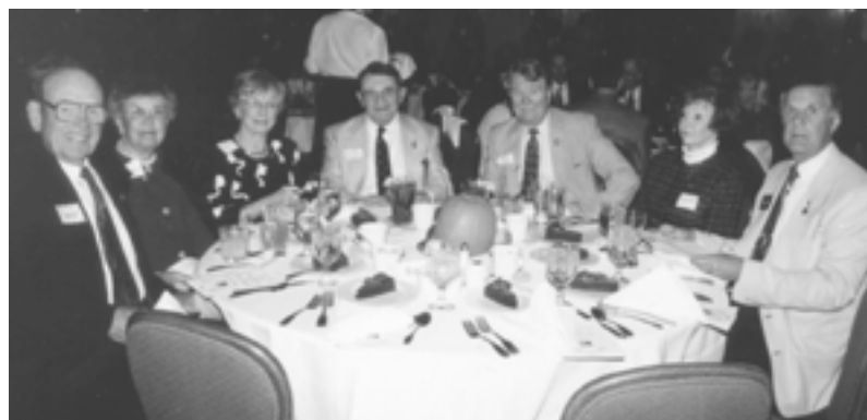
Past District Governors enjoy fellowship at the Rotary Foundation Banquet.

Great plans are being made for the upcoming District Conference. It will be held April 19-22, 2001 at the Hilton Hotel in Wilmington, NC. The program will begin on Thursday evening with a fantastic seafood buffet. The plenary sessions will be held Friday and Saturday mornings with free time to enjoy the sites, to play golf or tennis, to take a canoe trip or to simply relax. The nights will be a great time for food and fellowship. Sunday morning will be the final session and a short worship service. Make your plans now to have your club represented at this very important event in the district. Registration materials will be mailed to each Rotarian in District 7690 in early January.