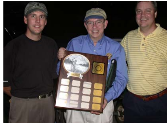
Crescent Team Wins Again. Looks for competition in 2006