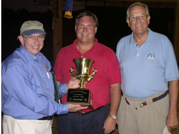
2005 Net Winners Swell With Belt Busting Pride

District Golf Tournament Pinewood Country Club, Asheboro. October 12