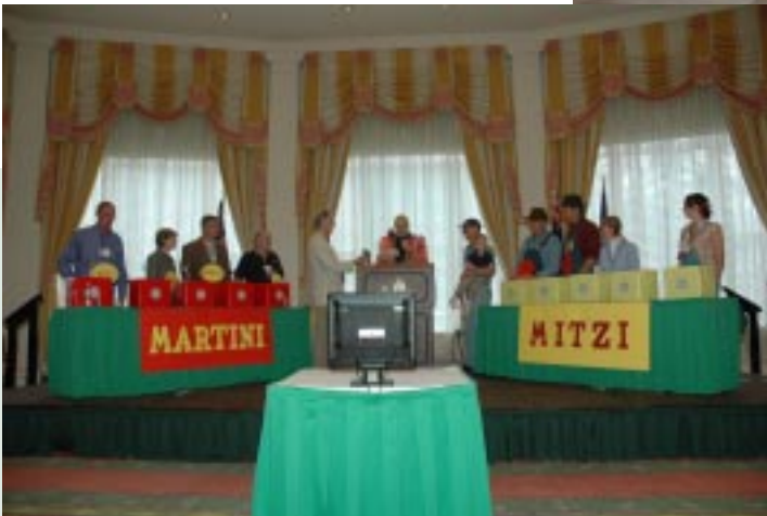
Family Feud was a "hit" at conference between the Martini Family and the Mitzi Family from West Virginia.