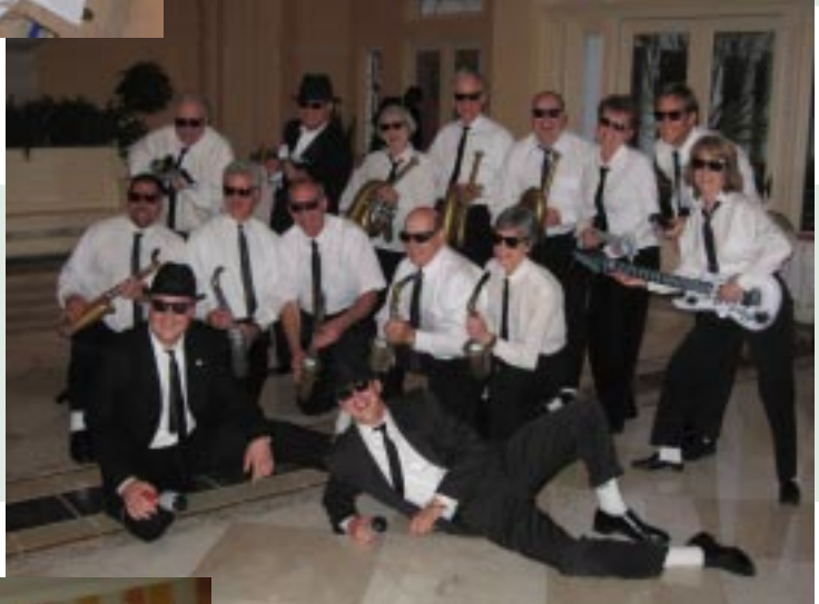
The Blues Brothers