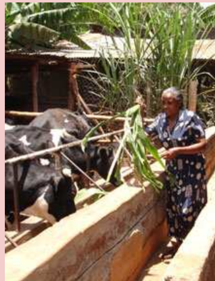
A dairy cooperative in Githunguri, Kenya. Cooperative near Nairobi.