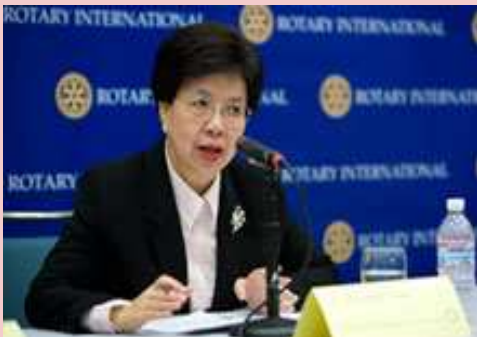
Dr. Margaret Chan, director-general of the World Health Organization, announced during a press conference at the 2008 RI Convention that polio eradication is now WHO's top priority.

In addition to providing financial and volunteer support, Rotary works to urge support from other public and private sector partners. This includes the campaign to End Polio Now, inspired by the extraordinary challenge grants received from the Bill & Melinda Gates Foundation.